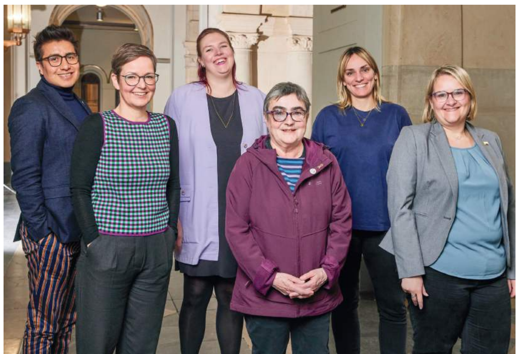
The board Rainbow Cities Network

Those numbers and findings are alarming and therefore, as a network, we wanted to put Queer Youth in the focus for our exhibition. We consider it important to recognize